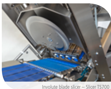
Involute blade slicer – Slicer TS700