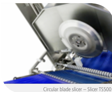
Circular blade slicer – Slicer TS500