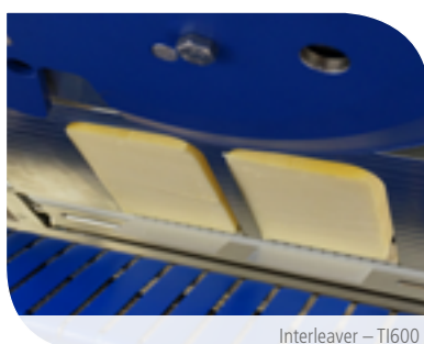
Interleaver – TI600