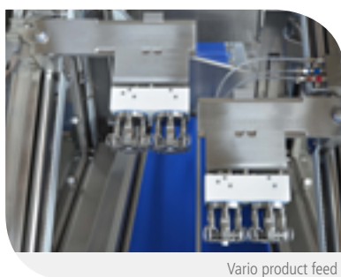
Vario product feed