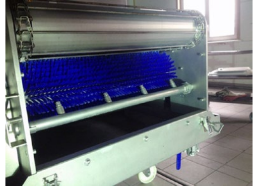
Continuous Conveyor Cleaning Brush