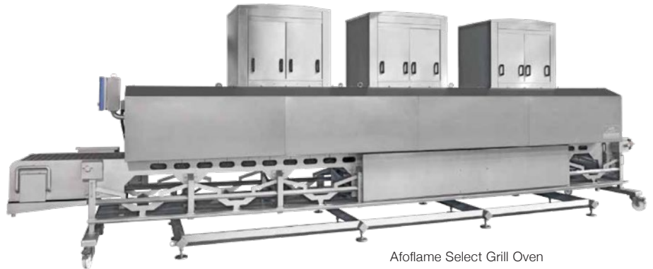
Afoflame Select Grill Oven

The Aoflame™ Select is a continuous grill oven equipped with gas-powered direct flame technology versus traditional infrared technology. It preserves the concept and numerous advantages of our Afogrill™ Select roasting solution.